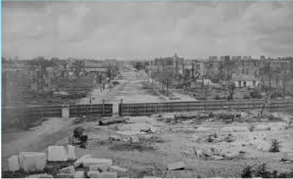
Reconstruction after the Civil War